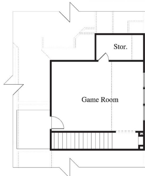
SECOND FLOOR PLAN B&C