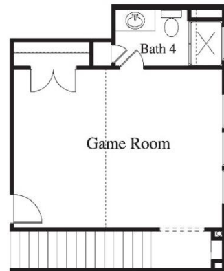
OPT. BATH 4